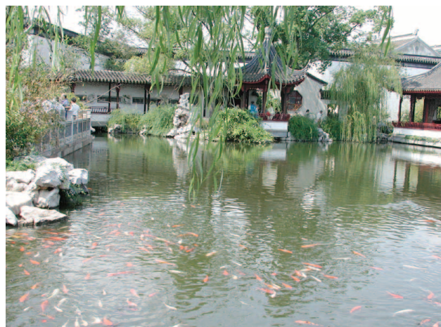
Beautiful city of Suzhou

We will in the future continue our effort in clinical, laboratory and experimental research, with an ultimate goal to develop translational medicine in the field of thrombosis and haemostasis and thus to serve our people better. In addition, we will continue to cooperate with our colleagues in the Asian Pacific region.