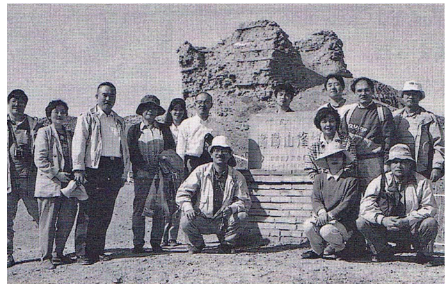
Dunhuang and West end of the Great Wall of China