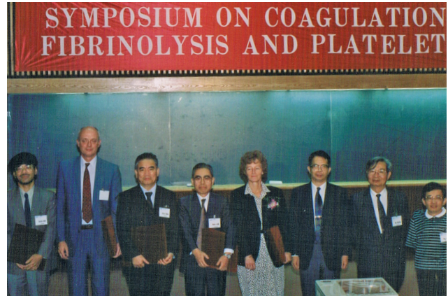
Speakers at the second Chinese-Japanese symposium