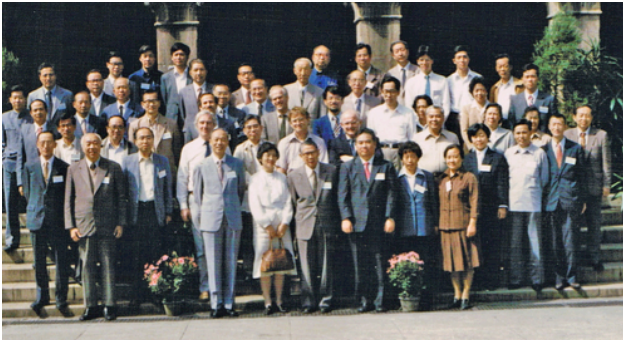
Participants of the Shanghai symposium