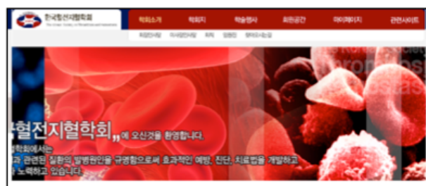
KSTH homepage: www.thrombo.or.kr