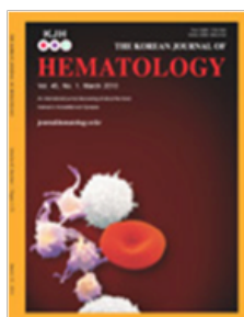
Korean Journal of Hematology

With new directors, staff, and members on board in 2010, KSTH adapted core efforts in recruiting new members, revitalizing the 5 sub-committees, expanding finances, restoring the KSTH official journal, drawing continuous participation and consultation from senior members and industries, and planning a Korean-written textbook on Thrombosis and Hemostasis. KSTH is currently publishing an English-language journal (Korean Journal of Hematology). Four volumes of the journal have been published per year in collaboration with the Korean Society of Hematology, Korean Society of Blood & Marrow Transplantation and Korean Society of Pediatric Hemato-Oncology.